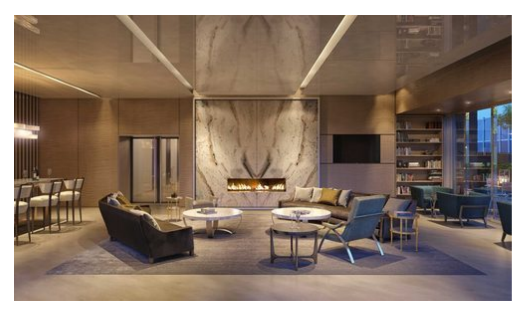
The building's lounge is part of a 12,000-square-foot "resident's club."